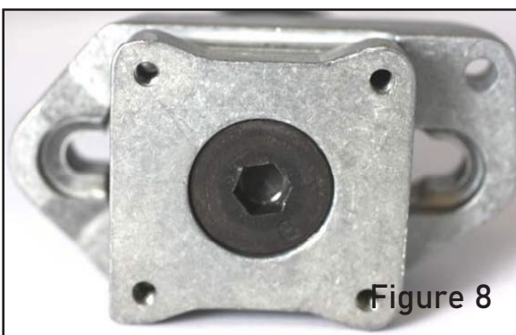
Figure 8 shows a counterfeit injector with the solenoid removed. The injector hold down clamp is also visible. This clamp on the counterfeit injector is made of aluminum as opposed to the steel clamp that is found on genuine injectors.

Figures 5, 6 and 7 depict a disassembled counterfeit injector. From these images it is easy to see there are no functional internal components.