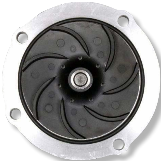
Previous Design Impeller