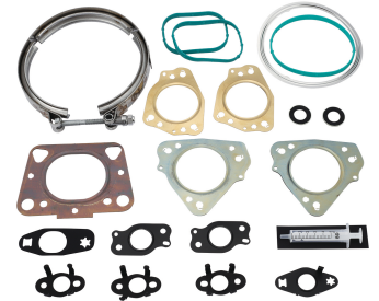
PART # AP0203